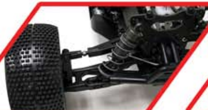
Stiffer arms, lower internal gear reduction.