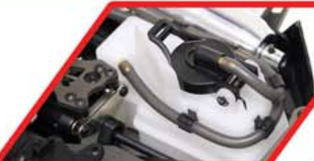
150cc fuel tank moved closer to the center, with quick fill cap included.