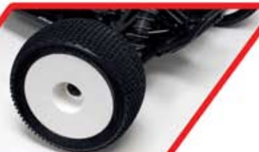
LPR tires and wheels for maximum performance.