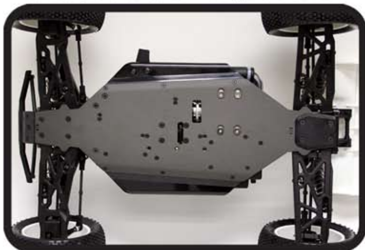
Hard Anodized Chassis