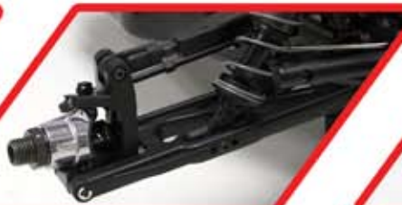
Aluminum front spindles with t-bolt (kingpin) design. (no more gluing)