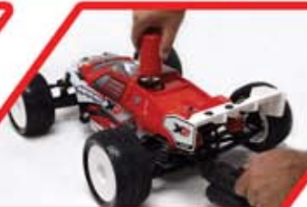
Shaft start makes starting as simple as a push of a button.