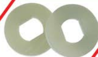
New anti-fade fiber front & rear disc brakes.