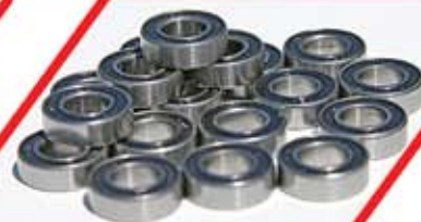
Complete set of 8mm x 16mm precision rubber sealed bearings for longer wear.