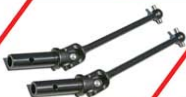
Front universals made of hardened steel alloy.