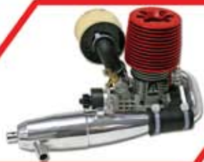
.28 engine with cooling head and polished tuned pipe for maximum performance.