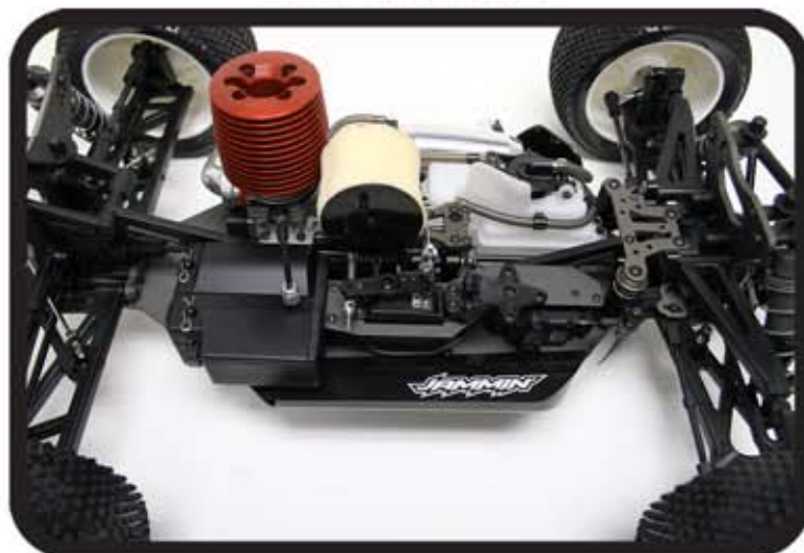
Radio Tray & Lay Down Steering Servo