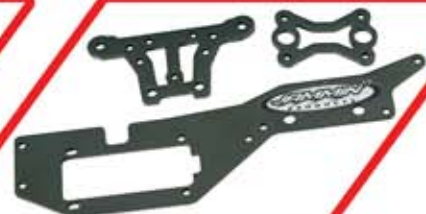
Anodized aluminum radio tray, front top plate and center differential mount plate.