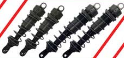
New Hard anodized 16mm super big bore shocks with threaded bodies and 3.5mm shock shafts.