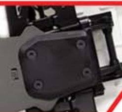
Rear skid plate helps protect chassis.