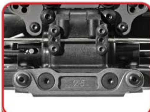
REAR TOE-IN BLOCK- CNC MACHINED HARD ANODIZED ALUMINUM.