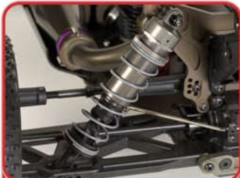
NEW 16MM SUPER BIG BORE SHOCKS. HARD ANODIZED THREADED BODIES WITH 3.5mm SHOCK SHAFTS. INCLUDES DUST BOOT & NEW BLATTER DESIGN.