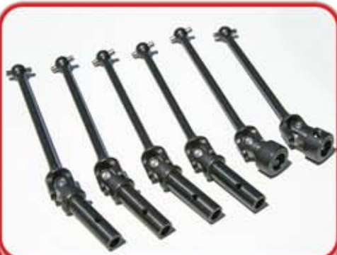
UNIVERSALS - FRONT, REAR & CENTER. LOWER GEAR REDUCTION ALLOWS FOR LIGHTER DRIVE TRAIN, ALONG WITH LIGHTENED OUTDRIVES.