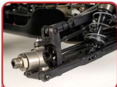
STIFFER FRONT & REAR SUSPENSION ARMS WITH T-BOLT KINGPIN DESIGN AND MULTIPLE SHOCK LOCATIONS FOR PROPER TUNING, NO E-CLIPS NEEDED.