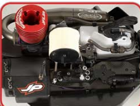
NEW NARROW CHASSIS DESIGN PUTS THE WEIGHT CLOSER TO CENTER LINE AND ALLOWS FOR STONE GUARDS.