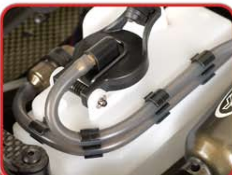
NEW INNOVATIVE FUEL TANK DESIGN WITH INTEGRATED FUEL LINE MOUNTS, SPLASH GUARD AND FUEL FILTER MOUNT FOR EASIER FUEL LINE ROUTING.