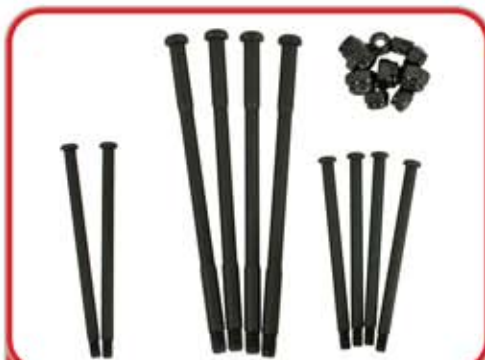
CAPTURED SCREW-TYPE HINGE PINS WITH LOCK NUTS. NO E-CLIPS NEEDED