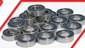
Complete set of 8mm x 16mm precision rubber sealed bearings for longer wear.