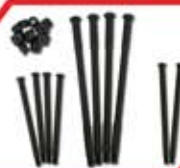
Captured screw-type hinge pins with lock nuts. No E-Clips required.