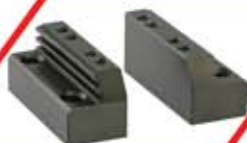
Engine Mounts - hard anodized billet aluminum, easily adjustable with cooling fins.