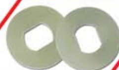
New anti-fade fiber front & rear disc brakes.