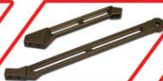
CNC machined hard anodized aluminum front & rear chassis stiffener with 2 mounting points to chassis.