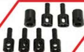
Light weight front, rear and center out drives.