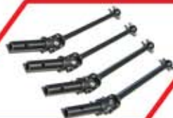
Universals in front & rear made of hardened steel alloy.