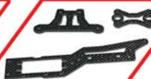
Carbon fiber radio tray, front top plate and center differential mount top plate.