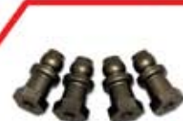
Light weight aluminum shock stand offs.