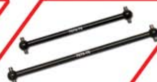
Light weight 7075 aluminum center drive shafts.