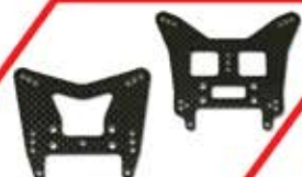
Light weight front & rear carbon fiber shock towers.