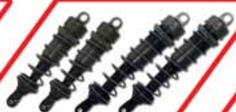
New 16mm super big bore shocks. Hard anodized threaded bodies with 3.5mm shock shafts.